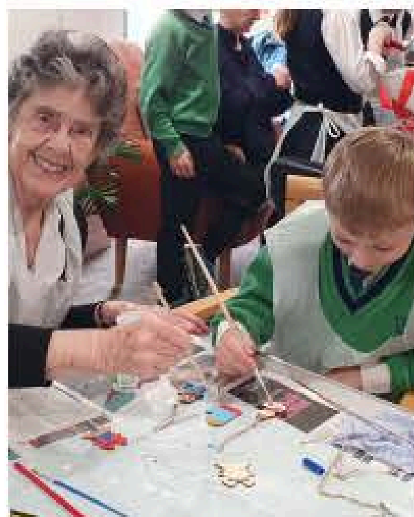
Crafting at Fern House, Bingley with children from Lady Lane Primary School

One resident said, "It's so lovely seeing the children here. I don't want to make anything, I'm not creative but I love to watch what they are doing and how clever they are."